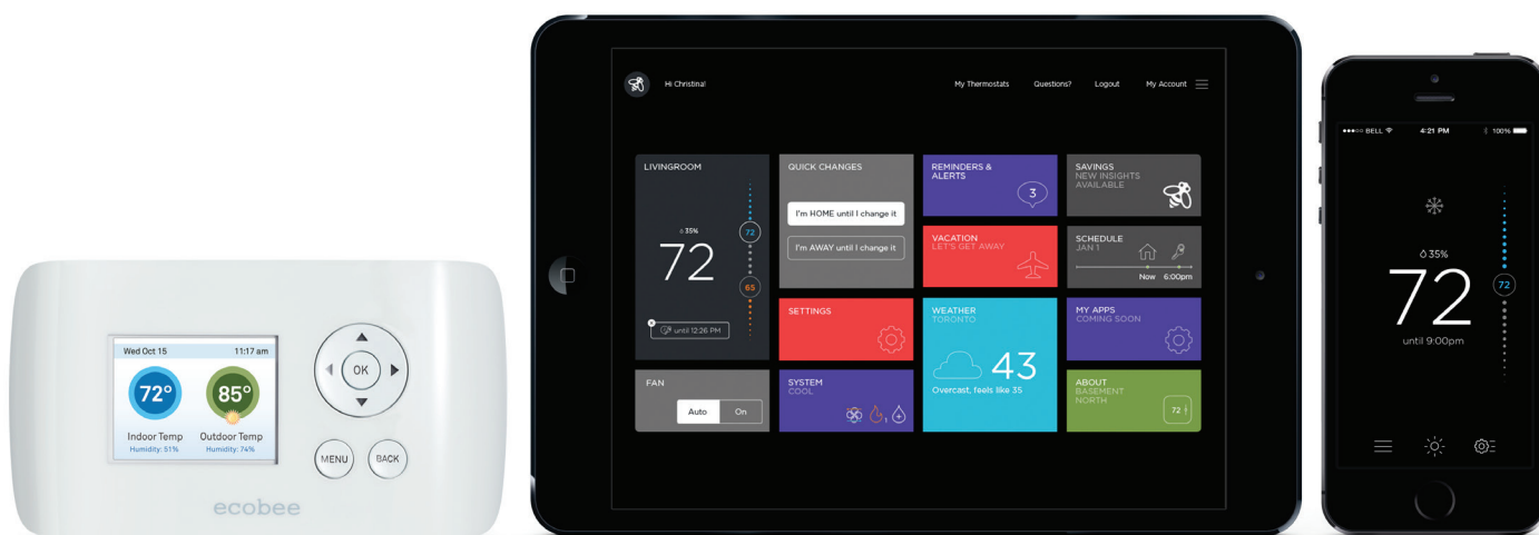
ecobee portal and mobile app